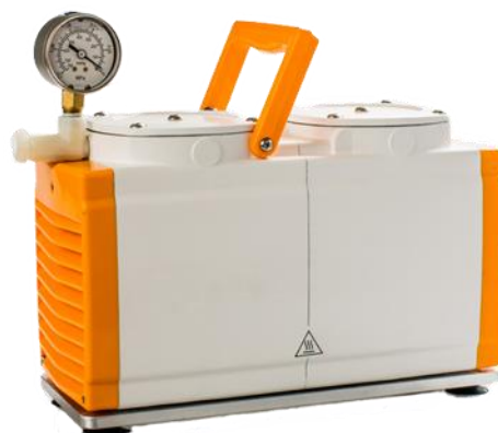
HCSVP050CR Corrosion Resistant