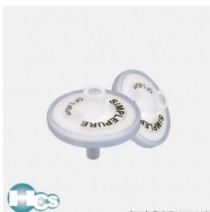
Syringe filters Simplepure